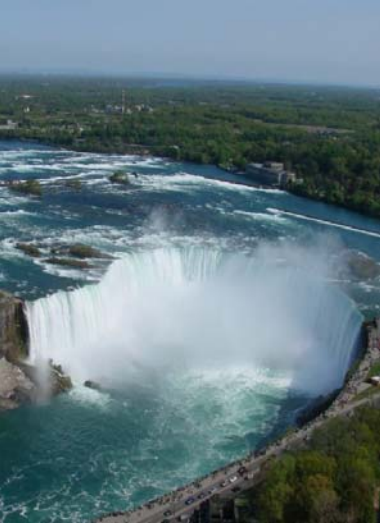
Above: Horseshoe Falls