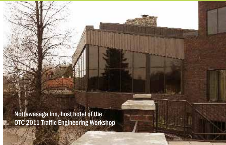
Nottawasaga Inn, host hotel of the OTC 2011 Traffic Engineering Workshop