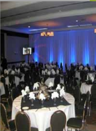
Above: Hotel Ballroom