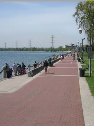
Above: Spencer Smith Park