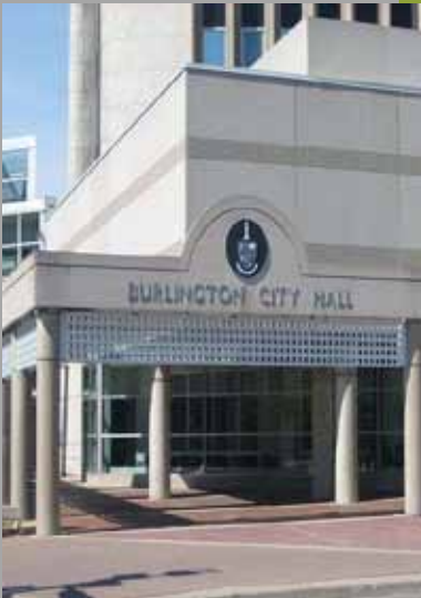
Above: Burlington City Hall